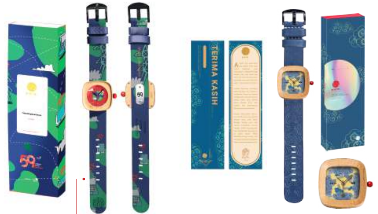
$4 Strap UV Print